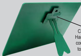
Combination Hanger & easel come attached to the plaque