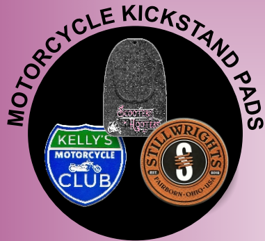
MOTORCYCLE KICKSTAND PADS