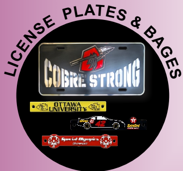
LICENSE PLATES & BAGES