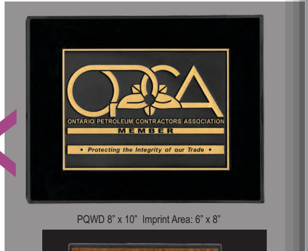
PQWD 8" x 10" Imprint Area: 6" x 8"

Your organization will stand out from the crowd with a high quality Stock Designed Plaque . Stock shapes allow us to quickly take your copy and convert it into an office wall or desk plaque.