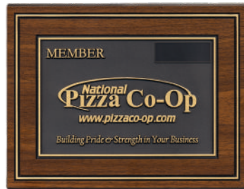
PQSW 6" x 8" Imprint Area: 3 1/2" x 5 1/2"