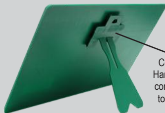
Combination Hanger & easel come attached to the plaque