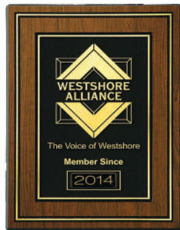
PQSW 6" x 8" Imprint Area: 3 1/2" x 5 1/2"

Your organization will stand out from the crowd with a high quality Stock Designed Plaque . Stock shapes allow us to quickly take your copy and convert it into an office wall or desk plaque.