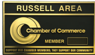
PQCC 5" x 8-1/2"