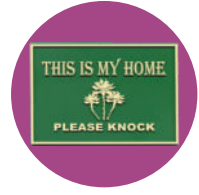
Example: CDiOC-24A is interior green plastic between 17 and 24.9 square inches with strip adhesive.