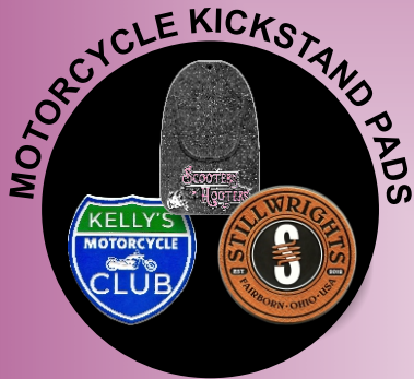
MOTORCYCLE KICKSTAND PADS